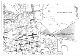
VICINITY MAP NO SCALE